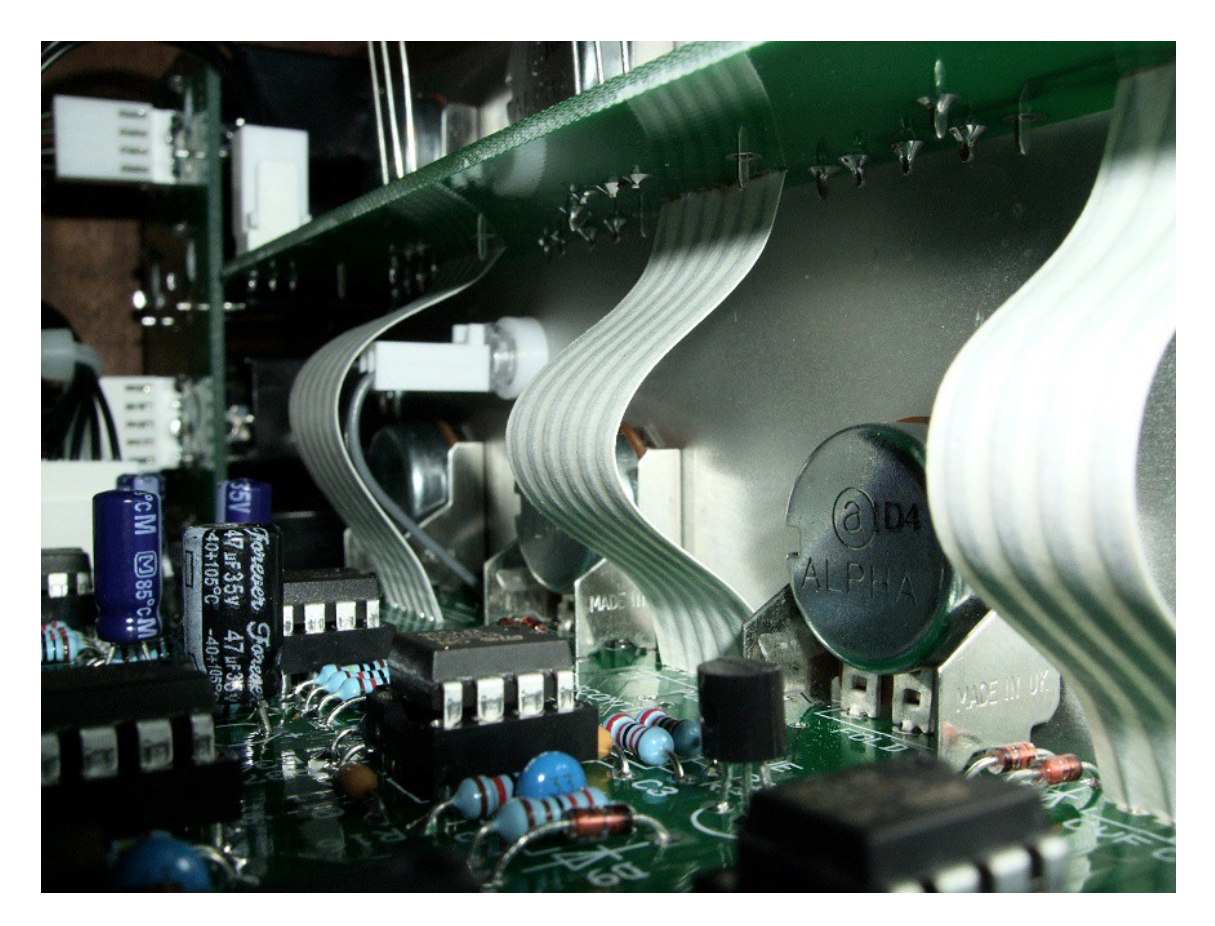
Close up of the pot board to main board interconnects and the LED connection. Here I have used my usual method of a two way Molex KK to attach the LED to two fly wires from the main board.

The LED and the Pot Board to Main Board Interconnects