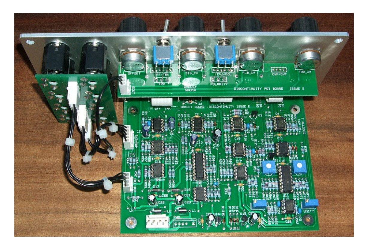
The earlier issue 2 Discontinuity fitted to a natural finish Schaeffer panel in the MOTM format. Issue 3 is almost identical. Note the use of the optional pot and socket boards to make the wiring up of the many sockets, switches and pots much easier.

For general information on how to build our modules, including circuit board population, mounting front panel components and making up board interconnects please see our generic Construction Guide at the project webpage or http://www.oakleysound.com/construct.pdf.