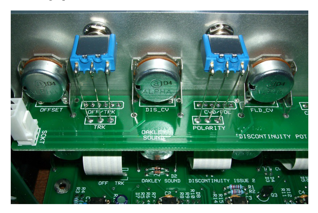
Both switches are wired identically with the switches' lugs connected to the pot board's solder pads directly below them.

I have tried to avoid any free wiring in this module and wiring up switches is my only lapse in this area. However, I think I have devised a nice neat way that is both quick and rugged.