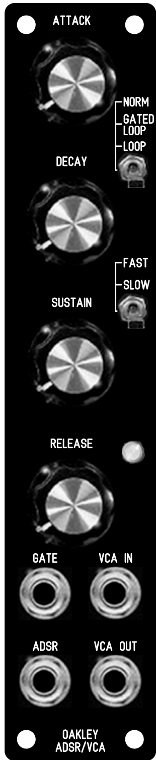
The suggested panel design for the Oakley ADSR/VCA module in MOTM format.