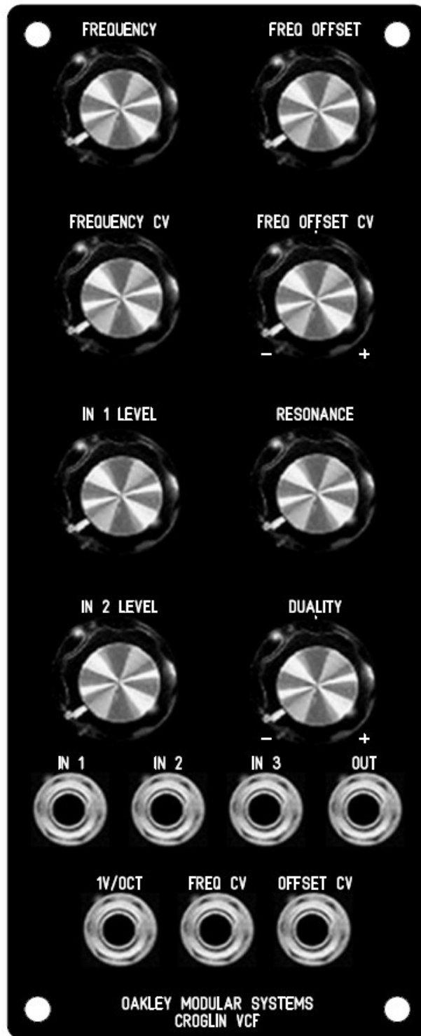
The suggested panel design for the full double width MOTM format module.