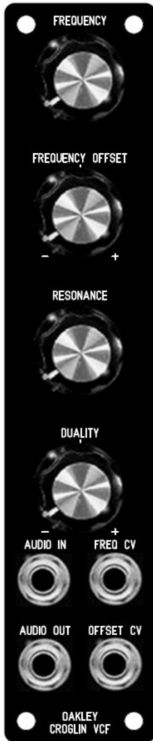
The suggested panel layout for the single width MOTM format module.