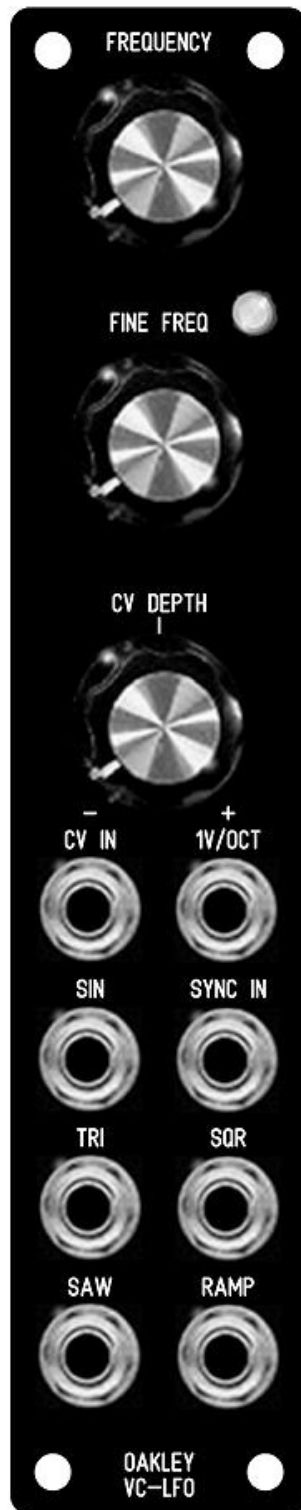
The suggested panel layout of the issue 3 VC-LFO module. This is different to the older issue 1 VC-LFO panel in that we lose a switch and gain an additional pot.