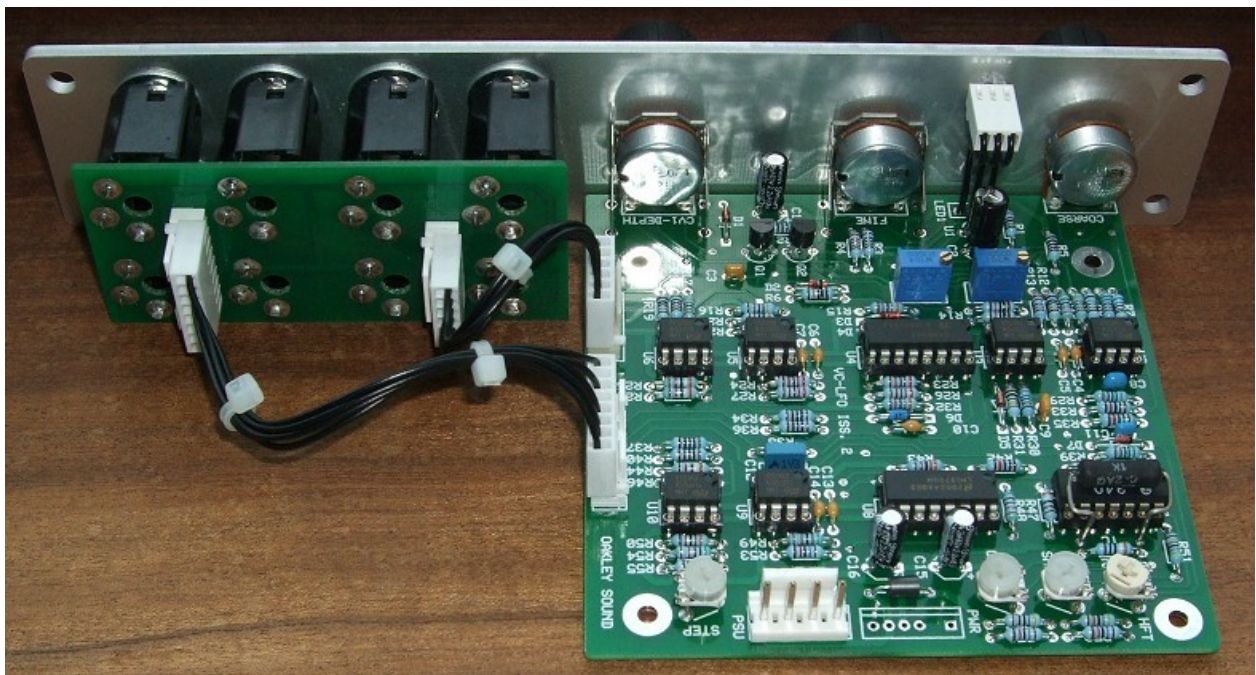
The issue 3 Oakley VC-LFO behind a natural finish MOTM format panel.

For general information on how to build our modules, including circuit board population, mounting front panel components and making up board interconnects please see our generic Construction Guide at the project webpage or http://www.oakleysound.com/construct.pdf .