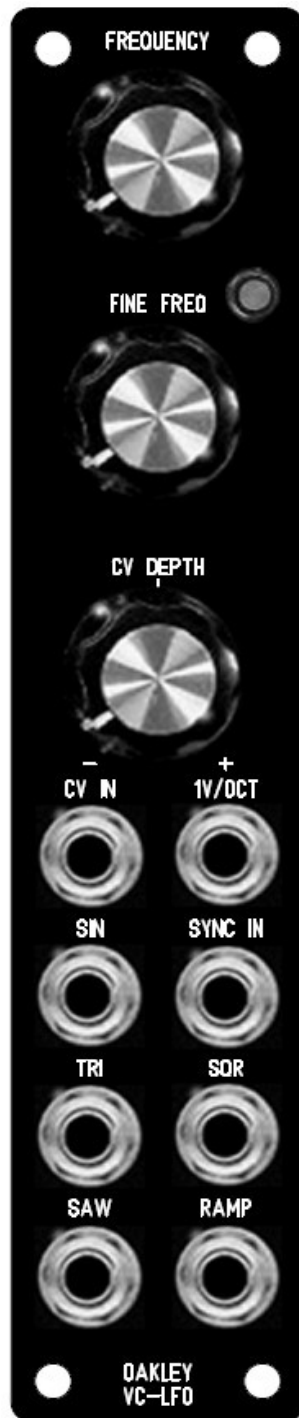
The suggested panel layout of the issue 3 VC-LFO module. This is different to the older issue 1 VC-LFO panel in that we lose a switch and gain an additional pot.